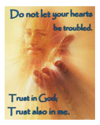
GOSPEL Reading on reverse of this page, right hand column

Alleluia, alleluia! All who love me will keep my words, and my Father will love them and we will come to them. Alleluia!