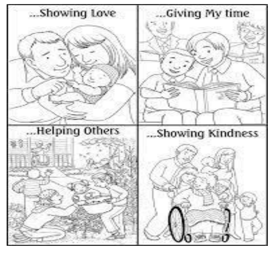
BACKGROUND ON THE GOSPEL

When have you ever allowed an opportunity to use your talents pass you by?